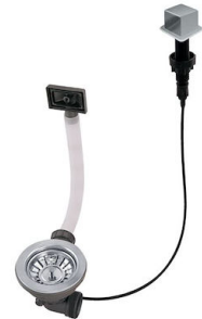
LIRA automatic waste fitting 8407 103